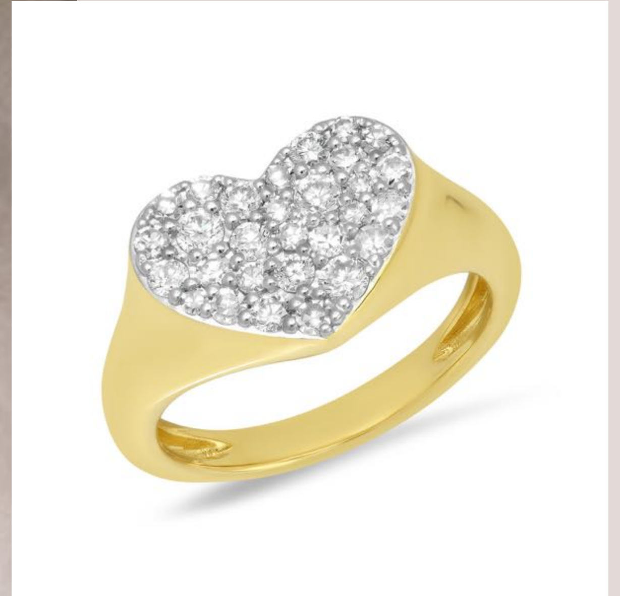
ERINESS Diamond Smushed Heart Pinky Ring