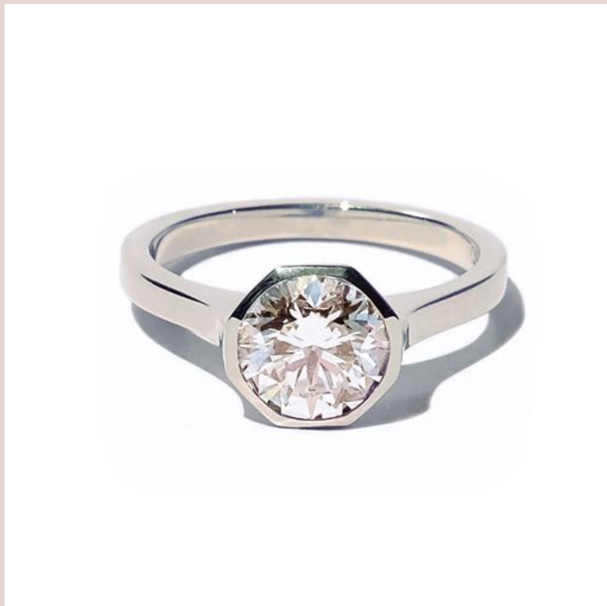
KATKIM Cosma Engagement Ring