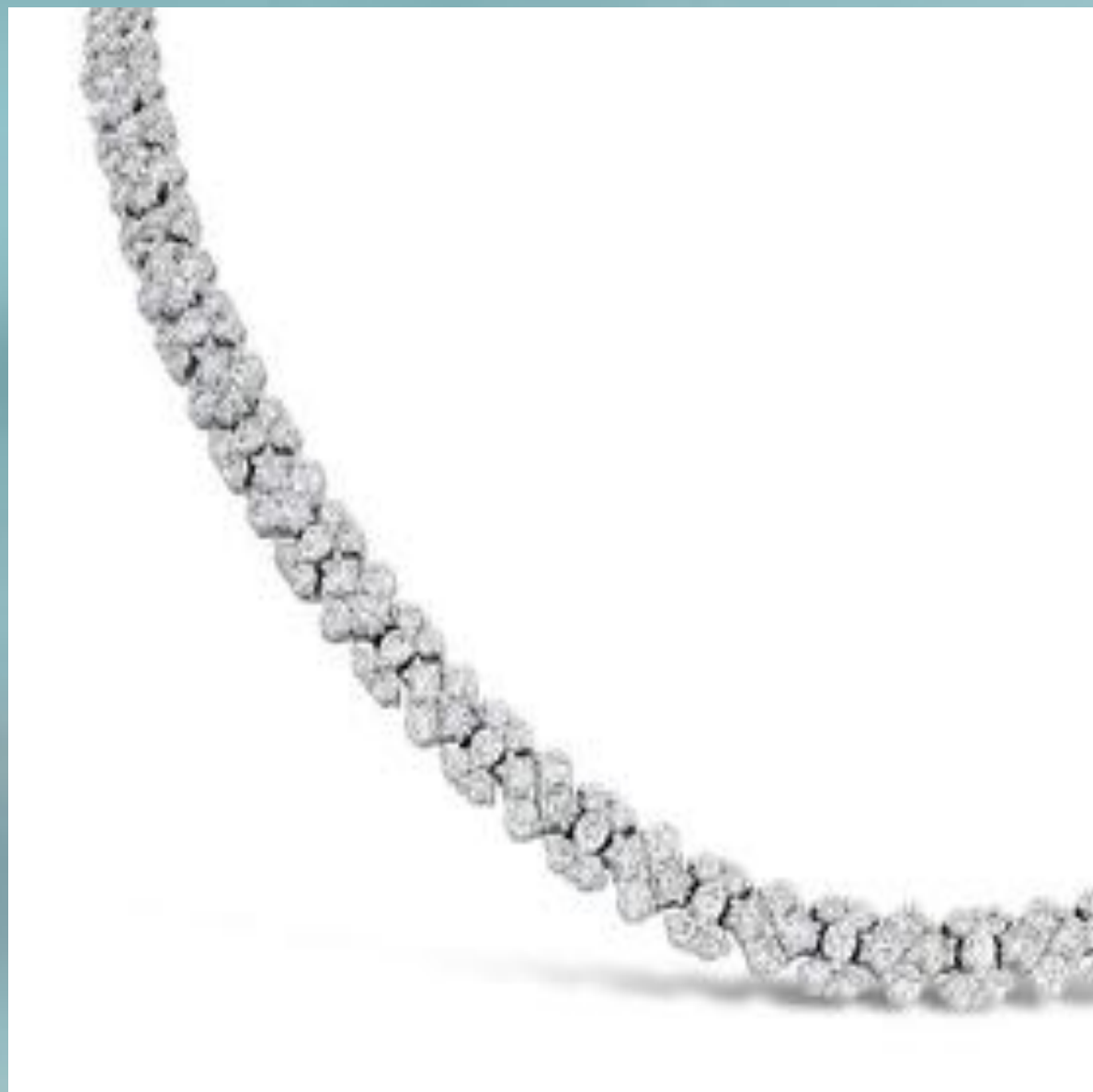
LONDON JEWELERS London Collection White Gold Pave Diamond Necklace