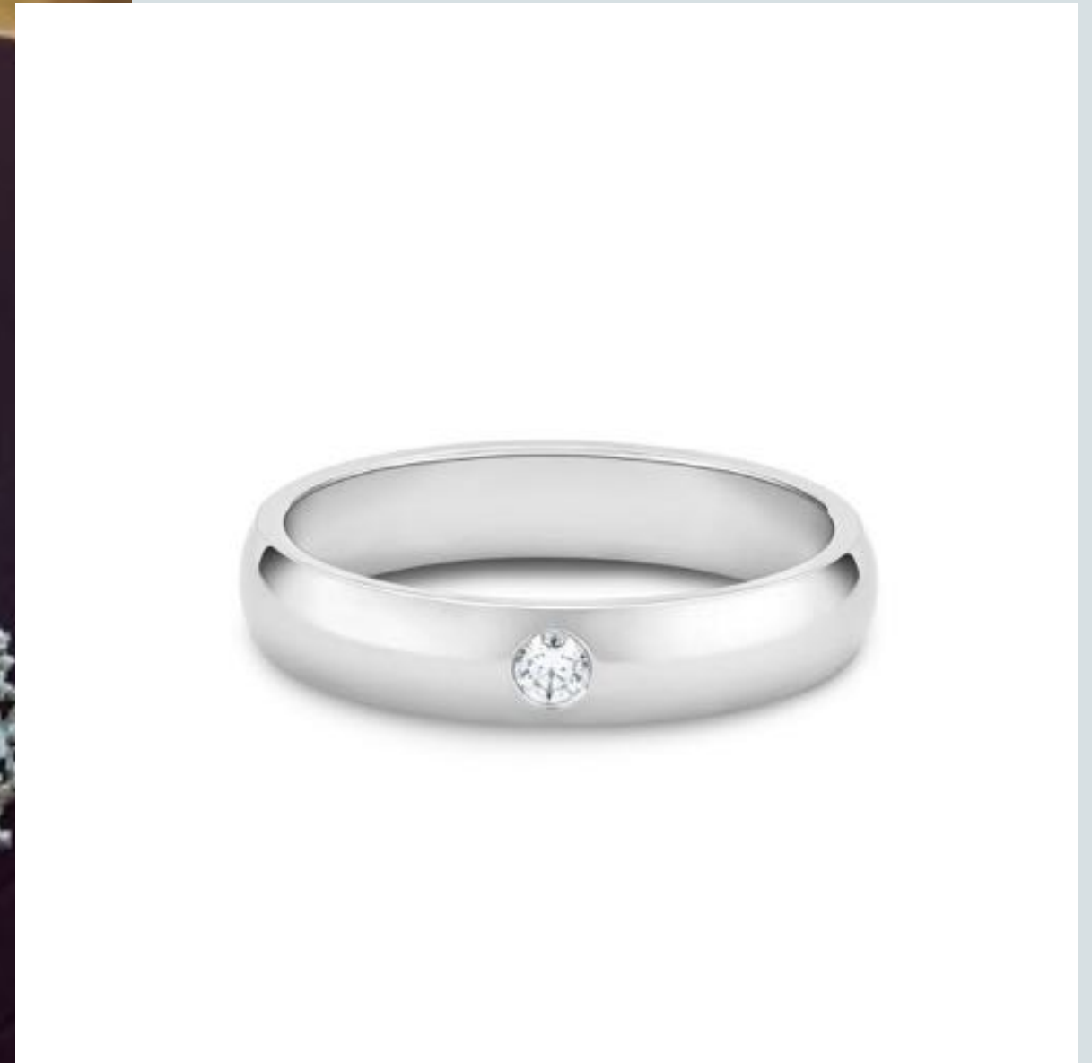
DE BEERS Classic One Diamond Band in Platinum