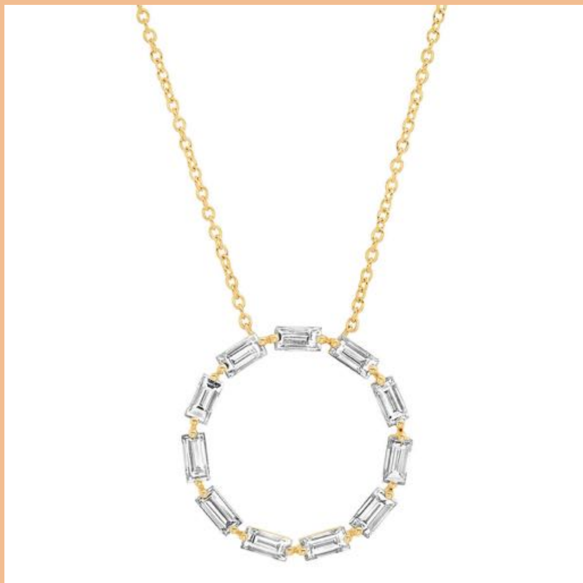
ERINESS Diamond Baguette Circle Necklace