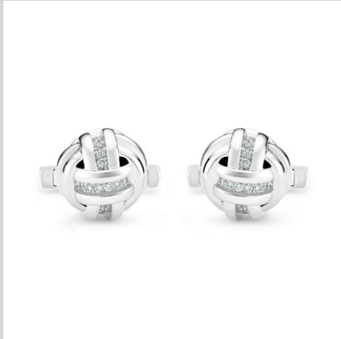
DE BEERS Knit Cufflinks in White Gold