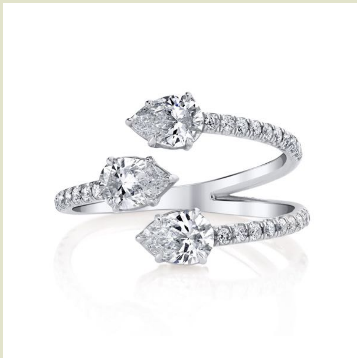
ANITA KO Three Stone Claw Diamond Ring with Pave Band