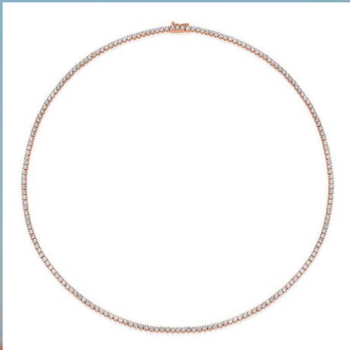
ANITA KO Rose Gold Diamond Hepburn Choker