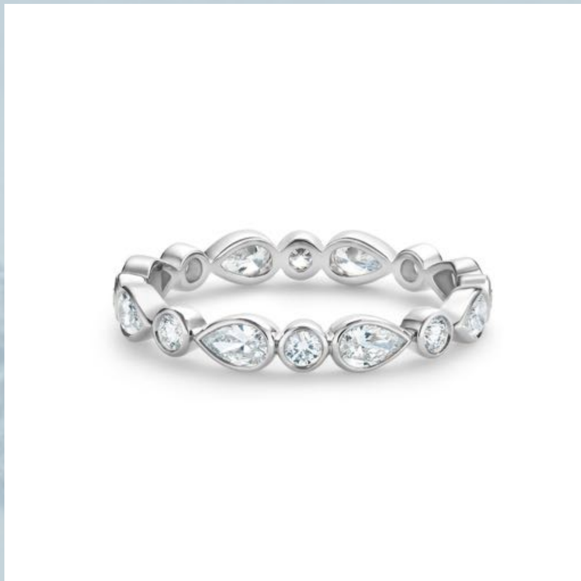
DE BEERS De Beers Diamonds Petal Band