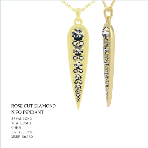
ROSE CUT DIAMOND NIFO PENDANT 36MM LONG TCW 0.95CT G-H/SI 18K YELLOW MSRP $6,380