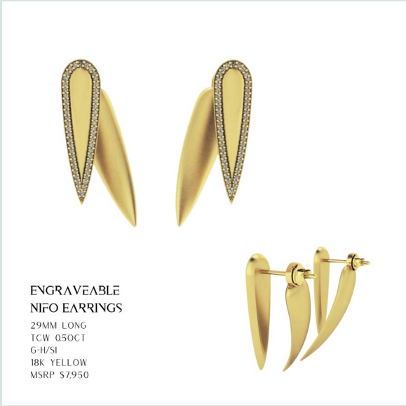
ENGRAVABLE NIFO EARRINGS 29MM LONG TCW 0.50CT G-H/SI 18K YELLOW MSRP $7,950