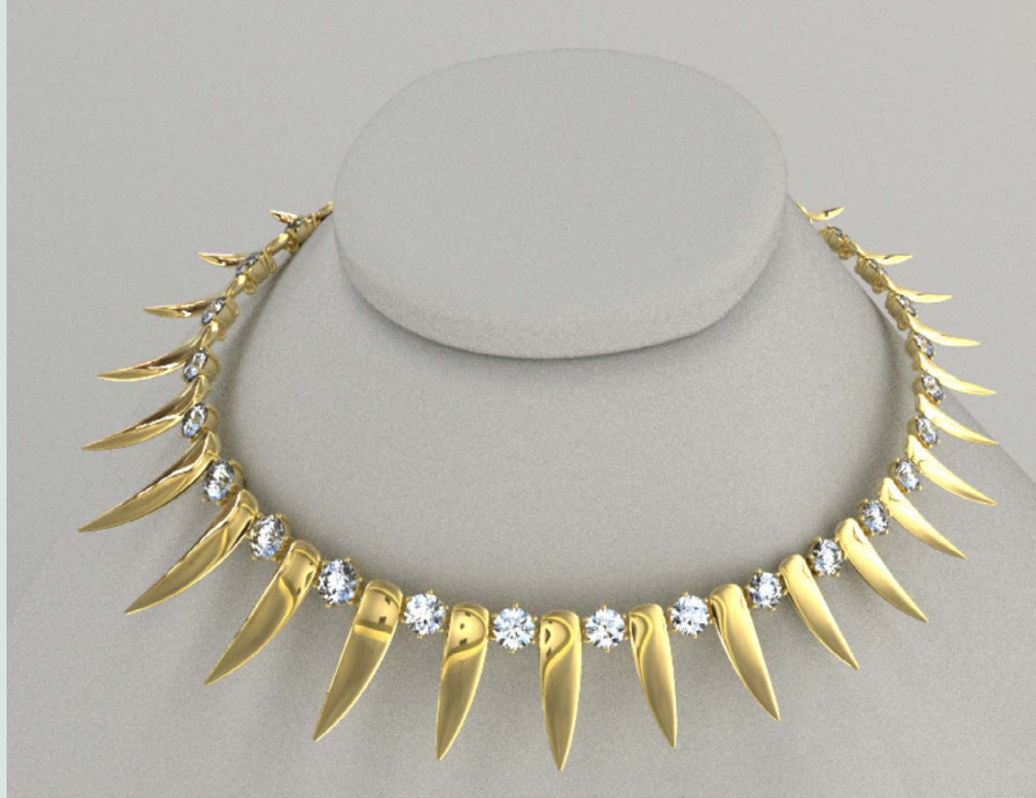
HERITAGE 16' + 3' EXTENDER ULA NIFO TCW APPROX. 23.5CT NECKLACE 18K YELLOW MSRP: BY REQUEST ONLY | PRICE DEPENDENT ON DIAMONDS