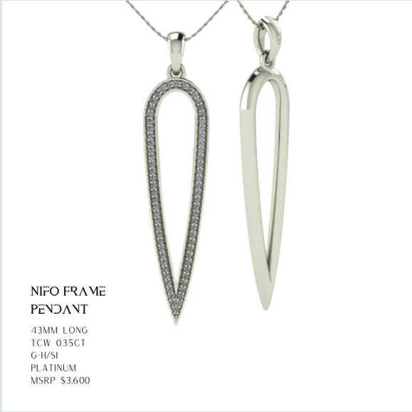
NIFO FRAME PENDANT 43MM LONG TCW 0.35CT G-H/SI PLATINUM MSRP $3,600