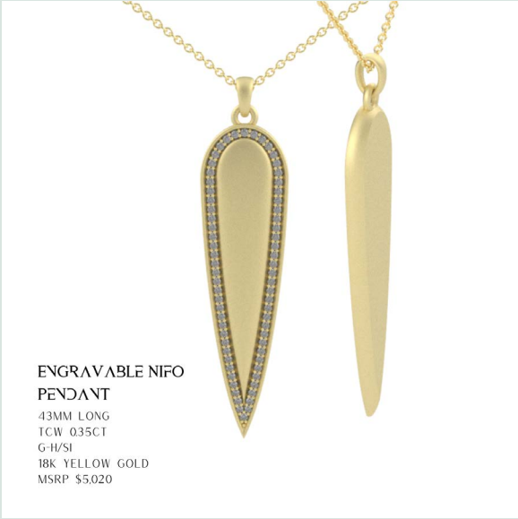
ENGRAVABLE NIFO PENDANT 43MM LONG TCW 0.35CT G-H/SI 18K YELLOW GOLD MSRP $5,020